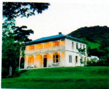
1: SHANA MALLET; 2: COURTESY OF JOCO; 3: CHEFSCATALOG.COM; 4: COURTESY OF MAMA O'S PREMIUM KIMCHI; 5: SHAPES & COLORS TEXTILES; 6: VIPPCOM; 10: COURTESY OF ANNANDALE